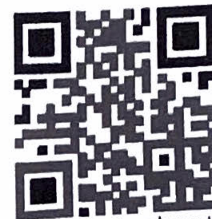
Scan here to view the Taxpayer Advocate Website

The Taxpayer Advocate Service (TAS) is an independent organization within the IRS that helps taxpayers and protects taxpayers' rights. TAS can offer you help if your tax problem is causing a financial difficulty, you've tried but been unable to resolve your issue with the IRS, or you believe an IRS system, process, or procedure isn't working as it should. If you qualify for TAS assistance, which is always free, TAS will do everything possible to help you. To learn more, visit taxpayeradvocate.irs.gov or call 877-777-4778.