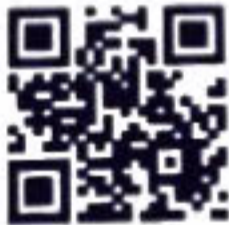
Scan here to set up an online payment agreement

Consider the following options if you can't pay in full right now: